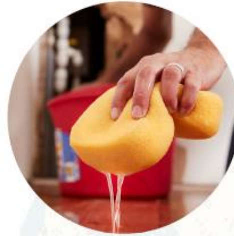
For Mopping Floors & Cleaning Glasses