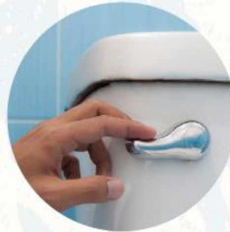
For Flushing Toilets