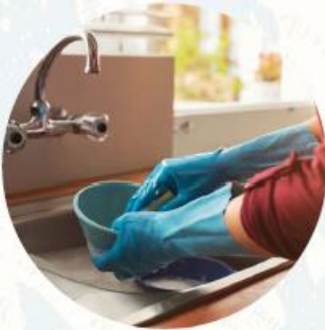
For Washing Utensils